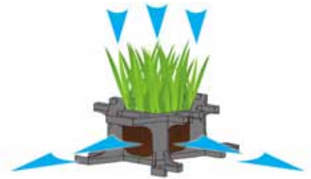
Grass Cell grass reinforcement structure allows horizontal and vertical root growth.

But Grass Cell goes a step further. With lateral openings within the structure, Grass Cell not only protects roots against compaction, it allows the roots of rhizomatous grasses to spread through the block within the protected soil layer. This creates a living, self-healing system which is not only resilient, but looks great year round.