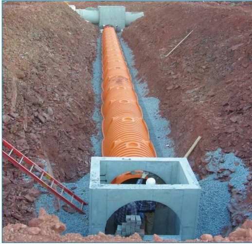
"A Septic Drainfield for Storm Water"

StormChamber™ Storage = 75cf Design Storage Capacity = 115cf to 161cf Length = 8.5' • Width = 5' • Height = 34"