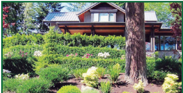
LANDSCAPING AND DEVELOPMENT