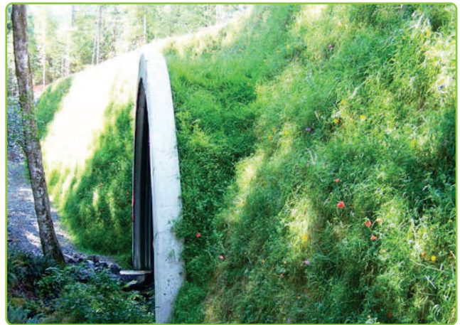
10m (33ft) tall municipal roadway