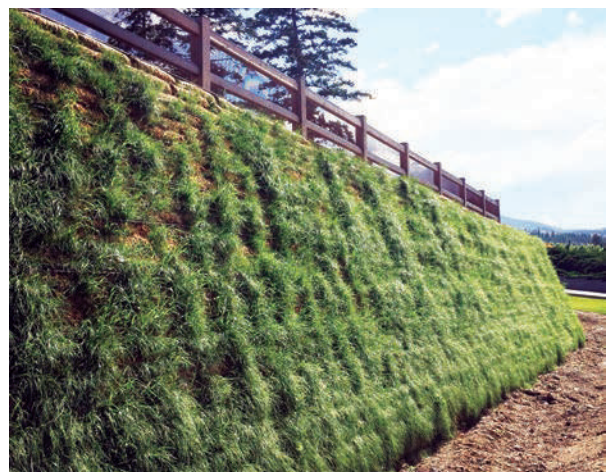
5m (16ft) tall landscape retaining wall

The Flex MSE Vegetated Wall system provides the strength of interlocking components without the need for concrete, rebar, wire mesh or other formwork.