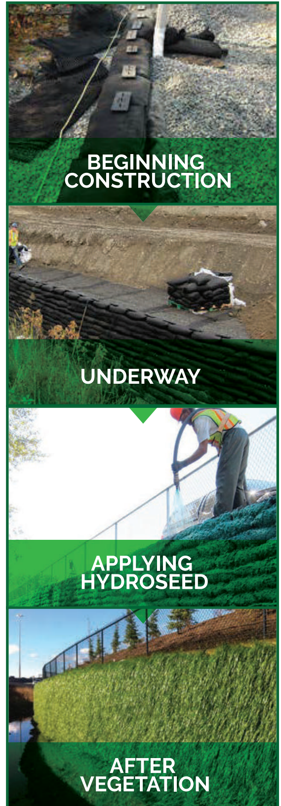
5m (16ft) tall commercial retaining wall