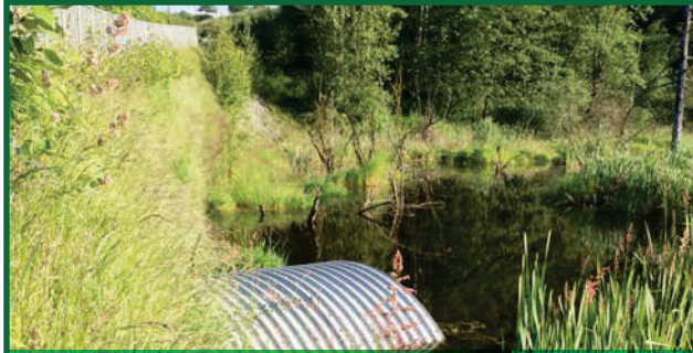
VEGETATED CULVERT HEADWALLS