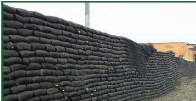
HIGHWAY WALLS AND SLOPES